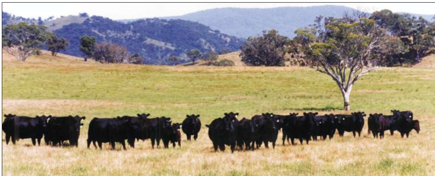
Angus cows have strong maternal and fertility traits and are easy care, efficient producers.

Angus are fertile and easy calving cattle. They reach puberty at an early age. Angus bulls give high conception rates with heavy