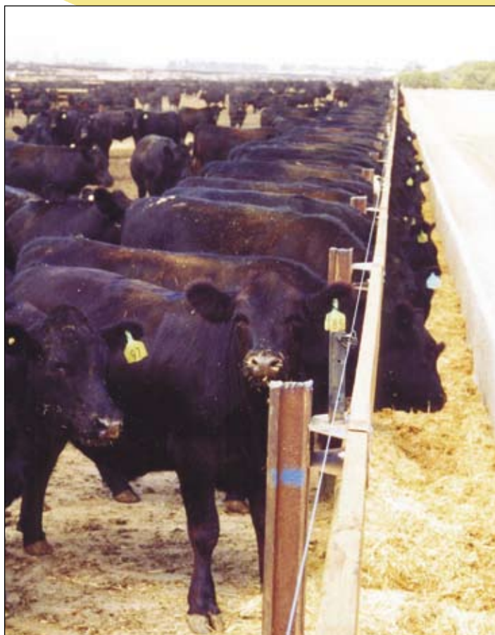
Many of the best and biggest lines of Angus steers are sold direct to feedlots.

© Angus Australia 2009. No part of this may be reproduced without prior permission from Angus Australia