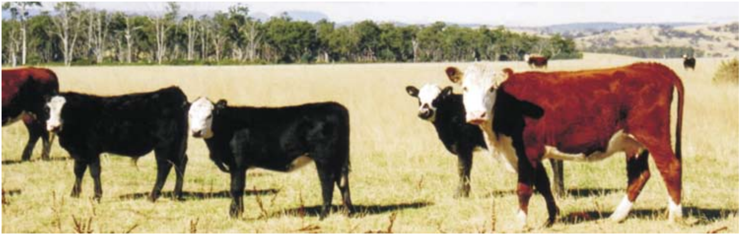
Angus bulls are being used in ever increasing numbers to gain feedlot demand.

working loads and achieve a compact calving pattern.